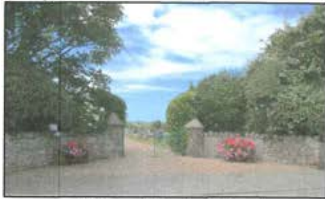
Entrance to La Croix Cemetery

The Cemeteries Committee of St. Pierre du Bois is responsible for the care and administration of the two parish cemeteries, De Beauvoir and La Croix (see map overleaf). The former is full, except for re-openings and it is La Croix which is currently in use.